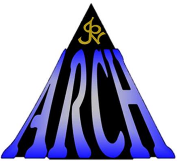
Achieving Reachable Challenges & Heights