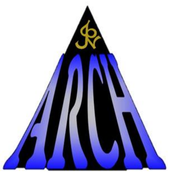
Achieving Reachable Challenges & Heights